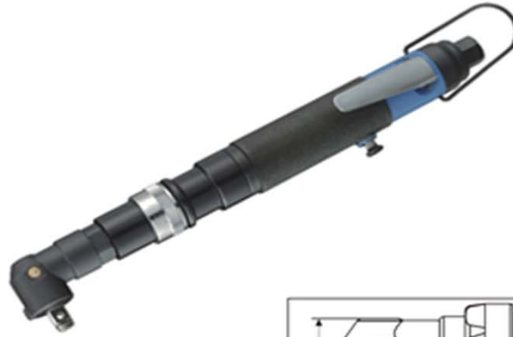
OP-5SLB08 3/8" OP-5SLB15 3/8"